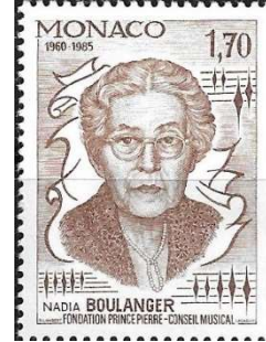
Monaco, 1985 Scott # MC 1473

This 1974 Aerogram includes a short note from Boulanger saying she regrets not having been with Russell on June 15 th (his 80 th birthday). Poignantly, acknowledging both of their advancing age, she closes by saying that she dreams they will meet again.