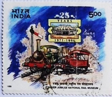
Indian Rail Museum

Founded in 6 May 1836 (185 years ago) and Headquarters in New Delhi, Owner: Ministry of Railways, Government of India.