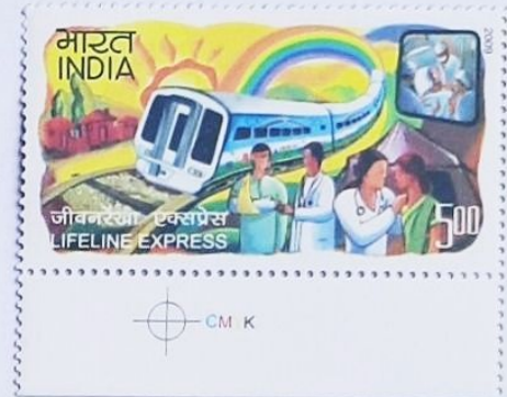
Life line Express

Employees: Number of employees 12.54 lakh (1.254 million) (2020).