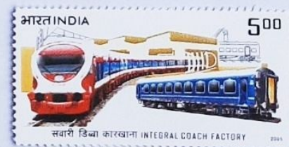
Integral coach Factory

Railway Integral coach Factory located in perambur near Chennai in Tamilnadu. Hills railways are famous in India especially Darjeeling and Nilgiri express . Individual budget review for Indian railways from government. Railways are the Real heart beat of India.