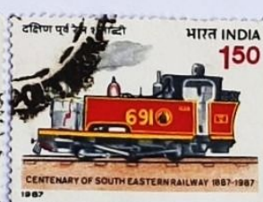
South Eastern Railways

Railway Integral coach Factory located in perambur near Chennai in Tamilnadu. Hills railways are famous in India especially Darjeeling and Nilgiri express . Individual budget review for Indian railways from government. Railways are the Real heart beat of India.