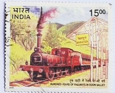
DOON Valley railways

Services in Railways: Passenger railways, Freight services, Parcel carrier, Catering and tourism services, Parking lot operations and other related services.