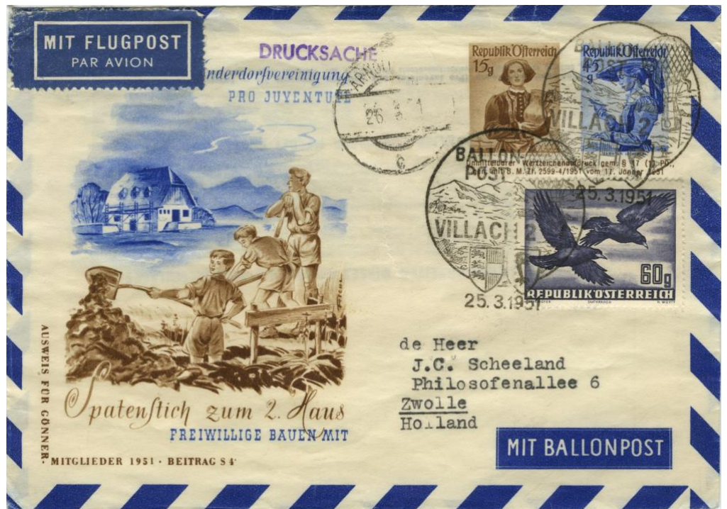
Austria 1950 Air Mail 60gr on 1951 Charity Event Balloon Post Cover from Austria to the Netherlands with special cancel (size reduced to 61%).

As well as air postage, the stamps were used on balloon post envelopes. Crows also featured in advertisements for other modes of transport such as trains.