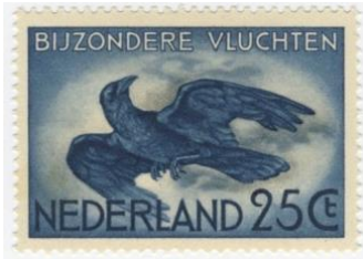
Netherlands 1953 Air Mail 25c stamp featuring a crow (Corvus corone). A 12 ½c version had been released in 1938. Both were for use only on special flights (Scott C-12).