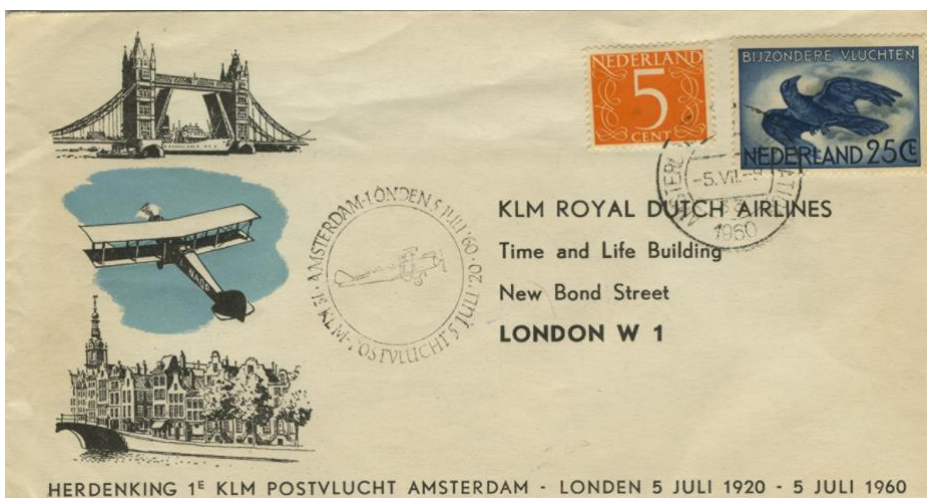
Netherlands 1953 Air Mail 25c on 1960 cover commemorating the 40 th anniversary of KLM's first flight from Amsterdam to London (size reduced to 45%).