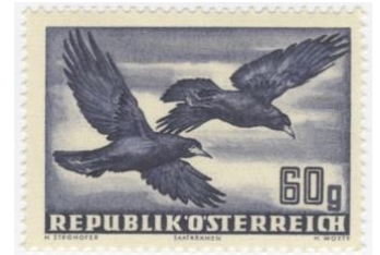
Austria 1950 Air Mail 60g featuring a crow (Corvus frugilegus). One of eight pictorial definitive air mail stamps featuring birds (Scott C-54).