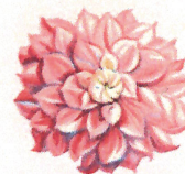
Dahlia USA 18c

Emmons' Dahlia Gardens, Battle Creek Michigan 25 September 1940. Probably contained a brochure promoting their dahlias. Postage $1.40 paid double the 1/2 ounce rate (70 cents) to Australia. Passed by Australian Censor. US was neutral at this time in World War II. Has 3 different cancels: killer bars, duplex, and machine circular. Flew domestically to San Francisco and then on Pan American Clipper FAM 19 from San Francisco to Aukland, New Zealand . Onto Australia via TEAL route to Brisbane on BOAC. Clipper departed San Francisco 14 October 1940. No back stamp; estimated arrival: 29 October 1940.