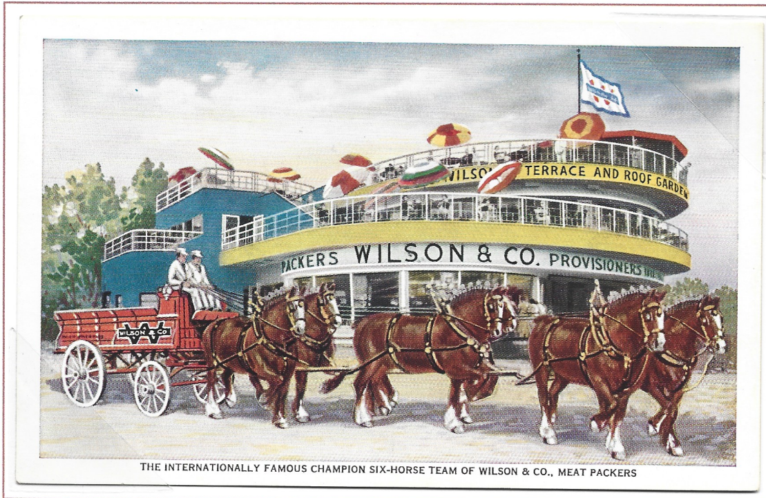
THE INTERNATIONALLY FAMOUS CHAMPION SIX-HORSE TEAM OF WILSON & CO., MEAT PACKERS

Each horse carried 100 pounds of harness and together pulled an orange wagon weighing 4400 pounds originally used to deliver meat from the Chicago stockyards. The horses were incredibly popular with the public and by 1953 the team had appeared in every state. Shortly after Ling-Temco-Vought (LTV) purchased Wilson & Co. in 1967, it disbanded the six-horse hitch.