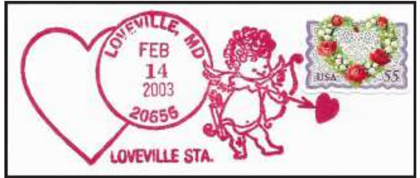
U.S. Pictorial Postmark, Loveville, Maryland

Origin: Aristotle incorrectly identified the human heart as having a rounded top and a pointed bottom.