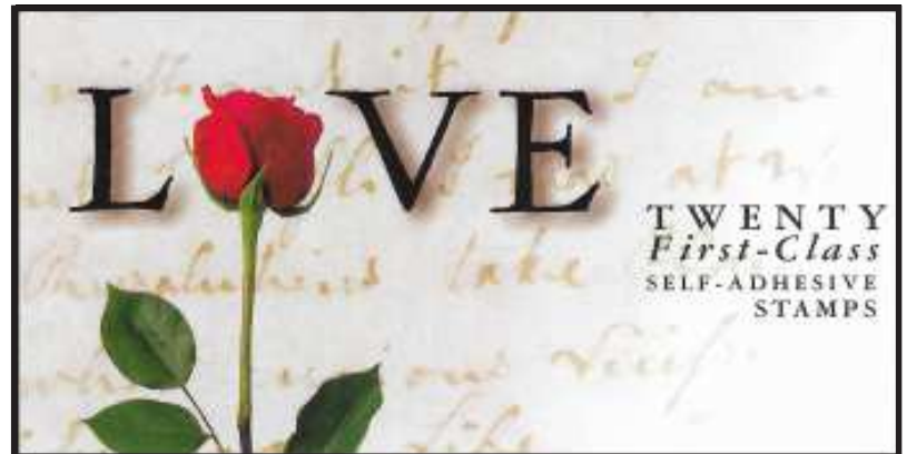
Booklet Cover, United States 2001. Reduced 15%