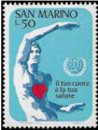
Stamp enlarged 33%

CUPID was renamed by the Romans from the Greek, Eros. His arrows caused the target to fall in love.