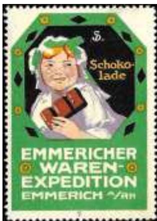
Poster Stamp, Germany