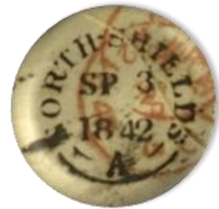
Figures 2 (left) and 3 (above). Obverse: Featuring backstamp (Circular dated double arc). From: NORTH SHIELDS SP 3 1842.