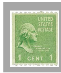
“Coil” Perforated 10 Horizontally Issue 1939