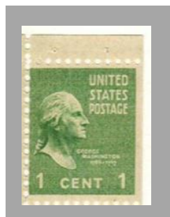
Booklet Perforated 11x10½ Issue 1938