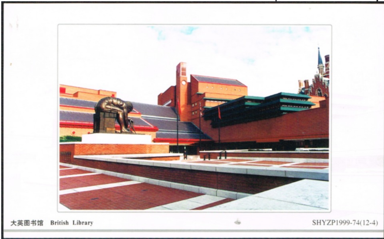
Exterior of the building with a sculpture of Sir Isaac Newton by Eduardo Paolozzi Chinese postal stationery card 1999

Exhibitor contact: wendybuckle@btinternet.com