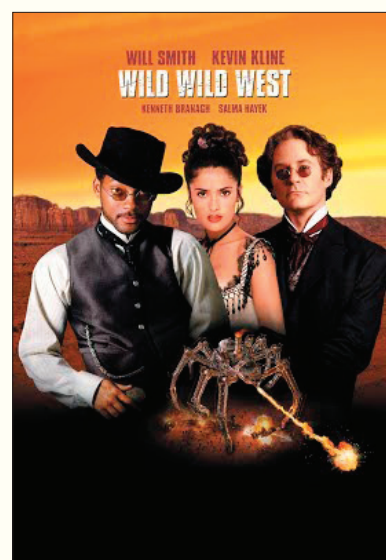
A walking giant steam-powered mechanized spider and fantastical gadgets for all purposes. Ohh MY!!

What if there was no electricity and our technology was based on Steam Power? That's how we might start to experience Steampunk. We can imagine Victorian-inspired tech like steam-powered airplanes - we already had steam-powered cars and trains. Add mechanical computing devices and we're on our way. Pull your goggles down and buckle your seatbelt time traveler!