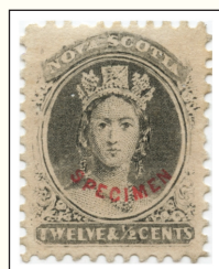
Queen Victoria Fake Stamp and specimen overprint

The Victorian Era had its own science fiction, perhaps most famously embodied in the works of Jules Verne and H. G. Wells. Throughout the 20th century there have also been later-day science fiction stories set in the Victorian period. So, in some sense, Steampunk has existed since the 19th century.