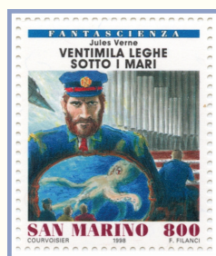
Captain Nemo of the Nautilus

Today, there are Steampunk Conventions where people dress up in Victorian versions of their alter-egos. There's no shortage of fun as imagination is the common key - you'll see anything from robots to wild west characters like in the movie Wild, Wild, West. And... we're off!!!