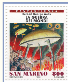
Aliens & Spaceships