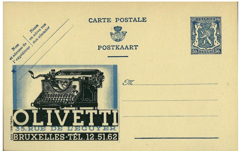
Left: 1911 poster stamp commemorating the Turino Exposition; Right: Belgium, circa 1940, 50 c Belgian centime—publibel postal card promotes the Olivetti Typewriter.