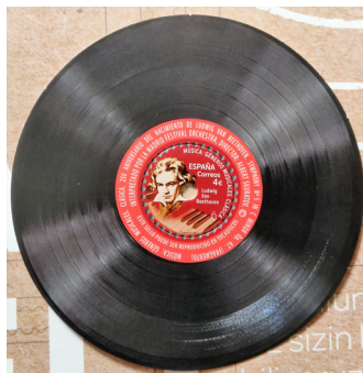
(Spain, 2020 | Beethoven 250-sheetlet can be played on a record player for Symphony No. 5 in C minor, Op. 67 | ES 4481)

Many innovative issues were released in 2020 to commemorate the 250th birth anniversary of Ludwig van Beethoven (1770-1827). Such as the Spanish stamp on a vinyl disc of his Fifth Symphony.