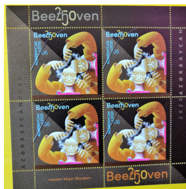
(Azerbaijan, 2020 | Beethoven 250 | Mi: AZ 1615)