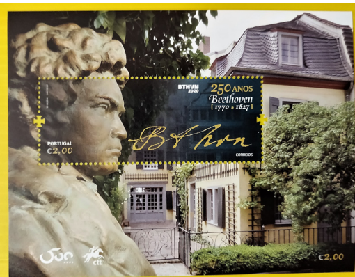
(Portugal, 2020 | Beethoven's House in Bonn where he was born in 1770 | Mi: PT 4589)