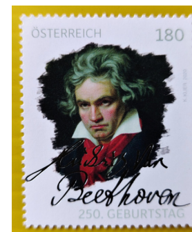
(Austria, 2020 | Beethoven 250 | Mi: AT 3553)

Beethoven moved to Vienna in 1792 at the age of 21 to become a musician. But at the age of 30, a hearing problem began to trouble him, threatening to stop his career as a musician. It was deeply frustrating. Although he could no longer work as a pianist, it prompted him even more to be remembered as a great composer. Beethoven wrote to a friend: “I want to grasp fate at the throat – it shouldn't bring me down completely.”