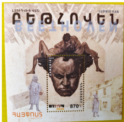
(Armenia, 2020 | Beethoven 250 | AR 1243)

Beethoven moved to Vienna in 1792 at the age of 21 to become a musician. But at the age of 30, a hearing problem began to trouble him, threatening to stop his career as a musician. It was deeply frustrating. Although he could no longer work as a pianist, it prompted him even more to be remembered as a great composer. Beethoven wrote to a friend: “I want to grasp fate at the throat – it shouldn't bring me down completely.”