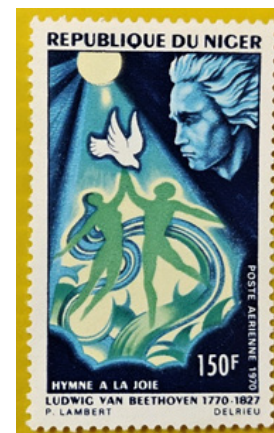
(Niger, 1970 | Beethoven, The Ode to Joy | NE C144)

At 46, Beethoven became completely deaf. At the age of 53, he composed the Ninth Symphony, based on the poem written by Schiller in 1785. At its premiere, as he was facing the orchestra with his back towards the audience, he was unaware of the audience breaking into a thunderous applaud, which he realized when he finally turned around. The Ninth Symphony represented freedom and democracy in a time when resentment was frowned upon by the authorities. Romain Rolland describes the voices of the orchestra as: “a paean of dynamic, youthful joy; a march of headlong challenge; a kind of La Marseillaise.”