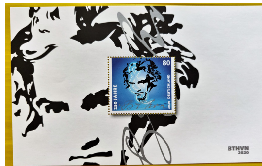
(Germany, 2020 | Beethoven 250 | Mi: DE BL85)

German painter Joseph Karl Stieler's portrayal of Beethoven in 1820 remains his most reproduced work and finds its way to many philatelic issues. The painting is striking because one can see Beethoven's determined face, defeating his sufferings.