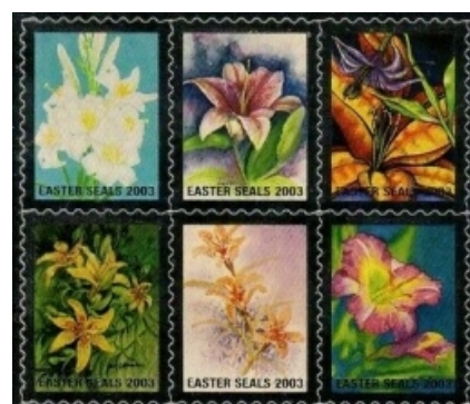
To the right is part of a sheet of Modern U.S. Easter Seals

Like all Cinderellas, Easter Seals are collectible. You will find them for sale on various stamp auction sites. The Stamp Forum, an online philatelic sharing site, has a section dedicated to U.S. Easter Seals, which can be found here: https://thestampforum.boards.net/thread/1048/easter-seals