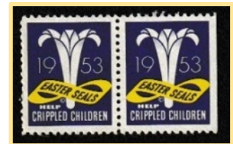
First Easter Seals stamp with lily.