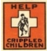
First National Society for Crippled Children stamp