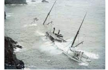
Final resting place just past Eddystone.