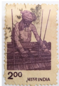
Yarn is dyed before being woven into cloth. The earliest looms used for weaving date back to almost 2,000 years ago.