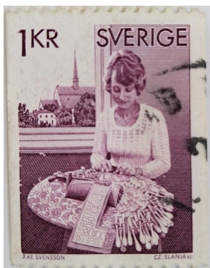
A modified form of hand weaving is used to make Bobbin Lace (known as Tønder Lace in Denmark). This form of lace evolved in the early 16th century, and was popular till the 19th century when it was replaced by machine-made lace.

Weaving is acknowledged as one of the oldest surviving crafts of the world. A handloom product is a piece of art that the weaver creates using different weave patterns.