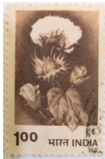
Natural fibres like cotton, silk, jute and wool are used to spin yarn

The creation of fabric using natural fibres is a story that weaves around art, artisans and a rich heritage that we strive to preserve