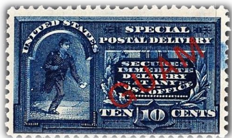
GUAM Scott #E1 (borrowed from the Internet)

Spent our 40 th Anniversary on this tropical island for a whole year - 2005