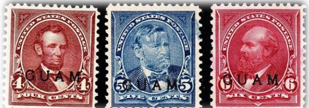
GUAM Scott #1-10