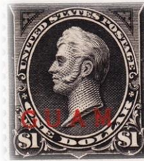
GUAM Scott #11 (borrowed from the Internet)