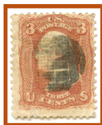
Piltdown Skull Fancy Cancel

Keith was a proponent of Piltdown man and his revered placement in the human family tree. He reconstructed fragments into a full skull. The skull's features reflected both archaic and modern traits and was believed to be the 'Missing Link', older and more prestigious than the Neandertal .