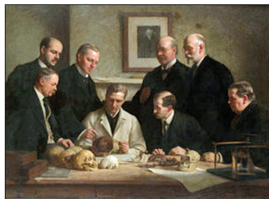
Sir Arthur Keith (white coat) examining Piltdown skull

Sir Arthur Keith (Scottish anatomist 1866-1955) was a member of the Geological Society of London . In 1912 they were presented unusual remains found by Charles Dawson (1864-1916) in a roadside gravel pit at Barkham Manor near Piltdown , East Sussex .