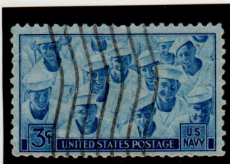
U.S. Navy sailors (U.S., 1945)