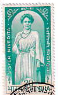
SISTER NIVEDITA, INDIA