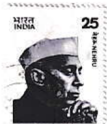
J. NEHRU, INDIA