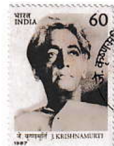
J. KRISHNA MURTI, INDIA