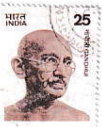
M.K. GANDHI, INDIA