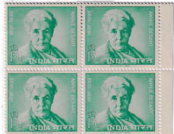
ANNIE BESANT, U.S.A, BLOCK OF 4