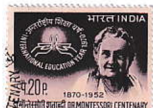
DR. MARIA MONTESSORI, ITALY