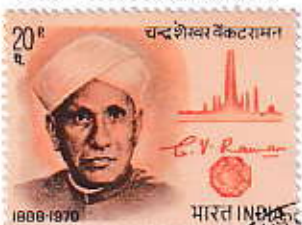
SIR. C.V. RAMAN, INDIA