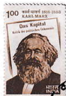
KARL MARX, GERMANY