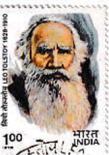
LEO TOLSTOY, RUSSIA