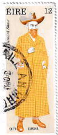
GEORGE BERNARD SHAW, IRELAND