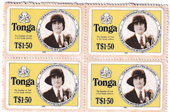
1985: TONGA,SELF ADHESIVE STAMP ON BLOCK OF 4