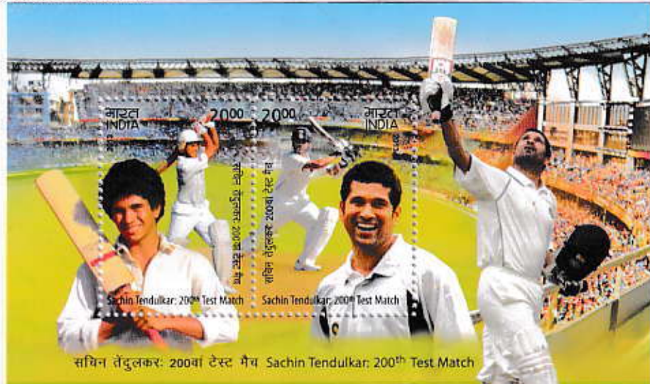
सचिन तेंदुलकर: 200वां टेस्ट मैच Sachin Tendulkar: 200th Test Match