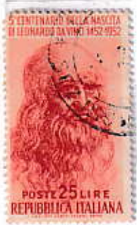
1952: ITALY LEONARDO DA VINCI

ONLY ABOUT ONE PERCENT OF PEOPLE ARE NATURALLY AMBIDEXTROUS, WHICH EQUALS OUT TO ABOUT 70,000,000 PEOPLE OUT OF THE POPULATION OF 7 BILLION.