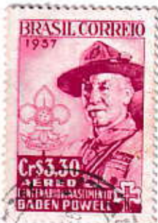
1957: BRASIL SIR BADEN POWELL