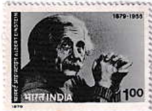
1955: INDIA ALBERT EINSTEIN