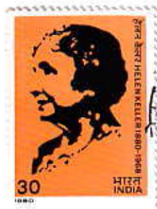
1968: INDIA HELEN HELLER