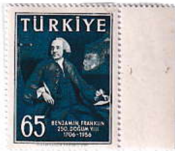
1956: TURKIYE BENJAMIN FRANKLIN WITH TAB