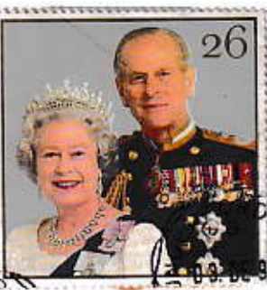
1997: BRITISH QUEEN ELIZABETH II