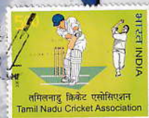
2007: INDIA, SOURAV GANGULY, PICTURE POST CARD