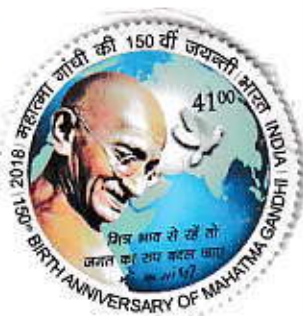
2018: INDIA M.K.GANDHI, ODD SHAPE