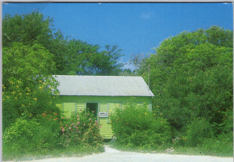
FORMER HELL POST OFFICE

Renovations to the Hell Post Office are shown in the postcard on the right.