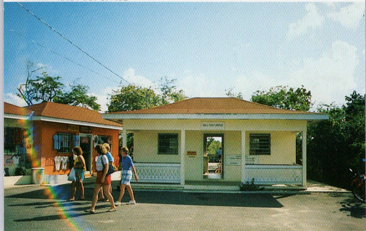
HELL POST OFFICE TODAY