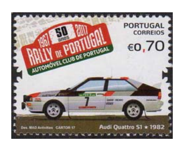
In 2017, Portugal issued the above stamp (as part of a set of stamps commemorating a Rally) showing an automobile described as an "Audi Quattro S1 1982". This is unfortunately, incorrect.