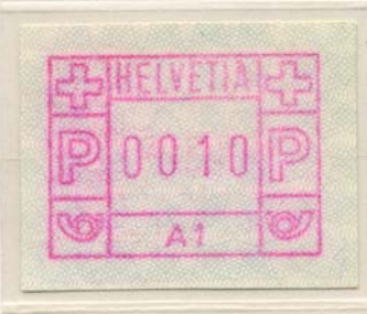
-Type 1 -Machine "A1" (Zurich) -Used from 9. Aug. 1976 to 24. June, 1978

Several varieties are known. Some of the difference are in the style of the lettering "HELVETIA", the color of the printing, the background pattern, and on the first machines, the control letter/number at the bottom. The most recent issue shows the Four Seasons, and type 9 is also found currently. There is no identification on the machine to let you know which design (plain or Four Seasons) you will receive.