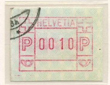
-Type 6A -Paper without fibers -Used from 9. Jul. 1981 to 11. Feb. 1991