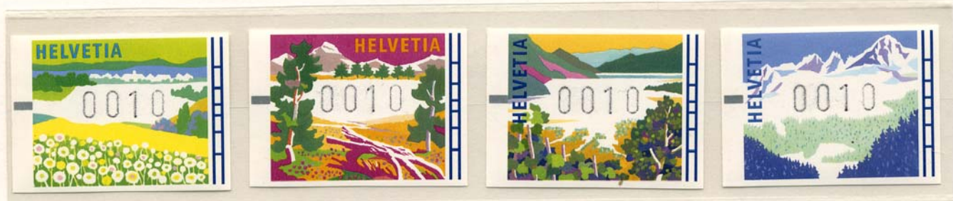
The current series of "Four Seasons" multi-color Framas, first day was 15. May, 1996