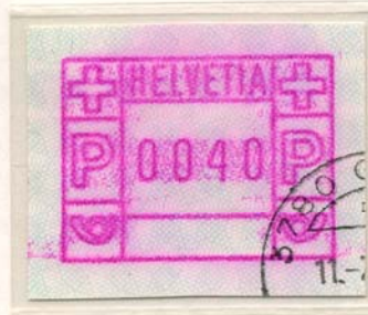
-Type 2 -Narrow "HELVETIA" -Used from 26. Jun. 1978 to 17. Oct. 1980