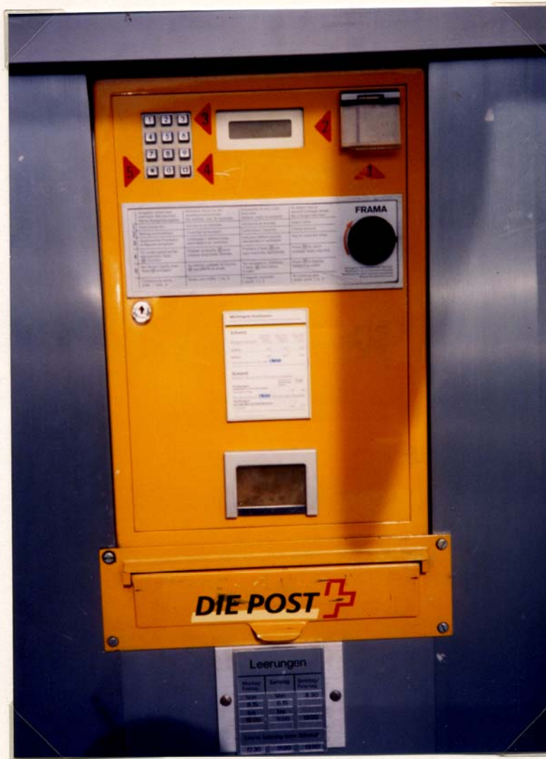
Frama postage machine in Davos, Switzerland. Instructions and general postage rates are clearly identified.