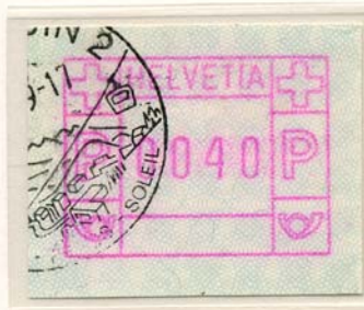
-Type 3 -Paper with fibers -Used from 12. Jan. 1979 to 25. Nov. 1981