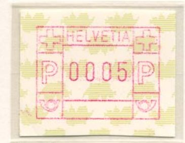
-Type 9 -Background is Swiss Map -Used from 2. Nov. 1993