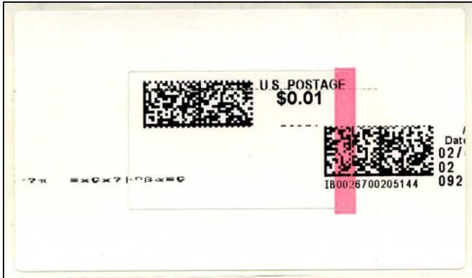
APC Postage Label Error