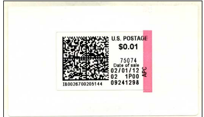
APC Regular Postage Label (printed just prior to the error)

“APC” = Automated Postal Center. These are self-service kiosks available in many US Post Office in the 24-hour lobby section.