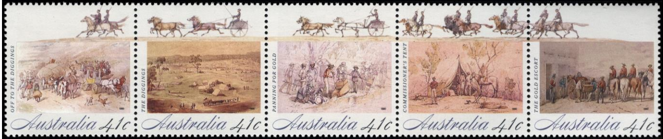
Off to the diggings