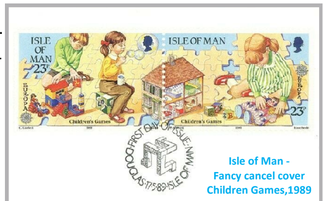
Isle of Man - Fancy cancel cover Children Games, 1989