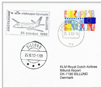
Netherlands KLM Airways-Amsterdam to Billund, Denmark First Flight Cover, October 25, 1992 (reduced)