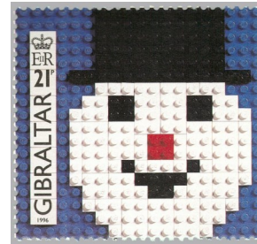
Gibraltar 1996 Lego Christmas Set