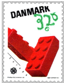
Denmark 1989 - EUROPA Stamps Children's Games

The Lego Group is a Danish toy production company primarily known for creating interlocking plastic bricks called Lego. The word lego originates from two Danish words leg and godt meaning “play well.” In Latin, it translates to “I put together” or “I assemble.” The Lego company was founded on August 10, 1932 in the carpentry shop of Ole Kirk Christiansen of Billund, Denmark.