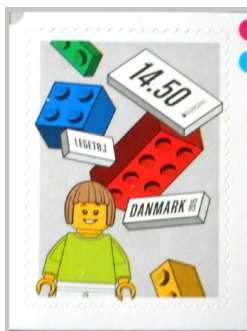
Denmark 2015-Lego S/A stamp 14.5k, Scarce with original backing

Ole Kirk built houses and furniture so his business was negatively impacted by the Great Depression. To stay afloat, he began creating wooden miniatures of his furniture. By 1932, Ole Kirk's shop was making wooden pull toys, piggy banks, cars, trucks, and even yo-yo's. In the mid 1940's, Ole began producing plastic toys, the first of which was a truck that could be disassembled and reassembled. Manufacturing of the first Lego bricks began in Denmark in 1947 and has now spread to factories worldwide. Ole Kirk Christiansen died in