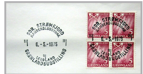
Greenland Special Stamp cancelled SDR. Strømfjord Legoland 6.5.1975

In addition to bricks and toy sets, the Lego company also built eight amusement parks around the world, each of which is named Legoland. The first Legoland park opened in Lego's hometown of Billund, Denmark. This was followed by parks in England, the United States (U.S.), Germany, Malaysia, Dubai, Japan and Korea. The Lego Group also operates 148 retail stores worldwide, with 83 of them in the U.S.