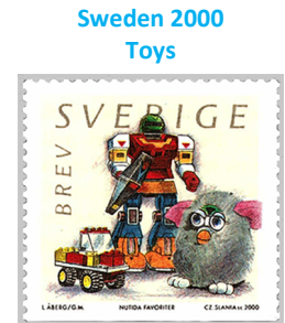
Sweden 2000 Toys