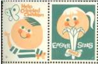
Easter Seals 1962

Many years ago, in 1962, I volunteered with a service organization to collect for Easter Seals. The winner of a drawing was to get an Easter bonnet. I wrote my mother's name on the ticket. When she received the phone call that she had won, it wasn't for a holiday hat, so she gave my name instead.