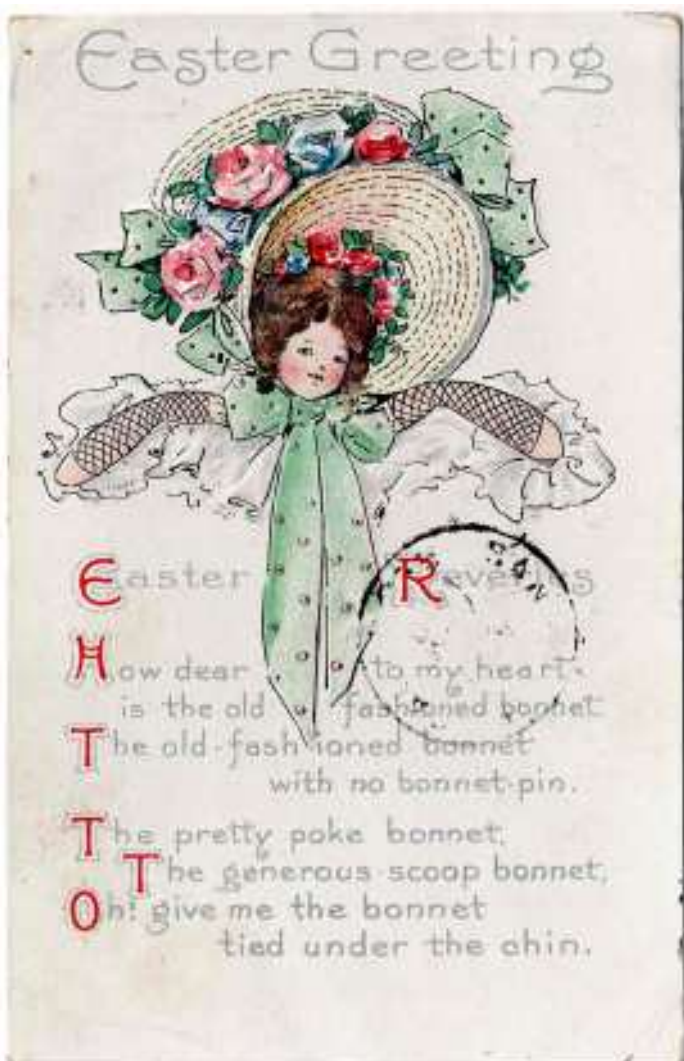
Postcard circa 1910