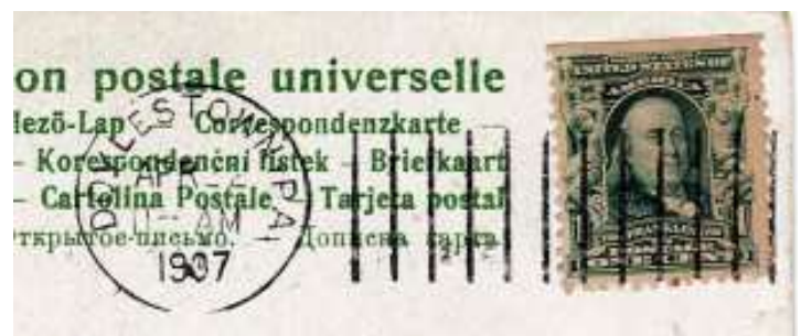
Doylestown, Pennsylvania 1907

Michener was born in 1907 in Doylestown, Bucks County, Pennsylvania, about 23 miles from where I grew up.