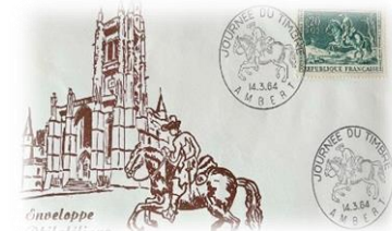
French pony express!

NB: All stamps are enlarged by about 30%, All covers reduced by about 30%. How does this exhibit make you feel?