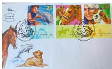
Animal assisted therapy in Isreal 2009