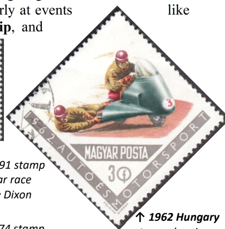
↑ 1962 Hungary stamp showing the Sidecar stunts.

Isle of Man 1982 Maximcard showcasing Jack Taylor the Sidecar TT race winner of 1978, 1980 & 1981 →