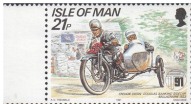
↑ Isle of Man 1991 stamp showing Sidecar race winner Freddie Dixon