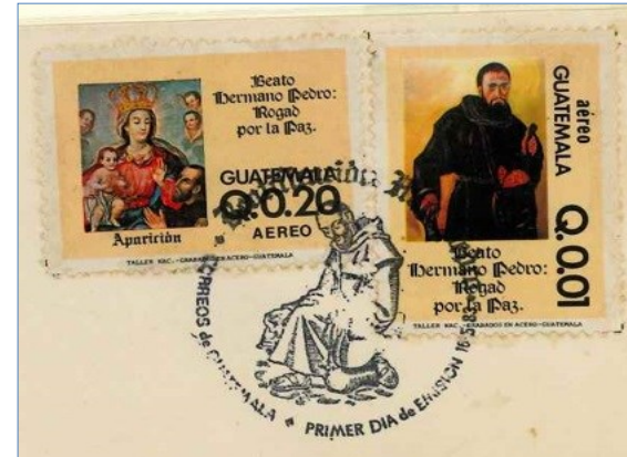
Cancellation First day of Circulation REGULAR AIR POSTAL ISSUE OF 1983, BLESSED BROTHER PETER

Beatified Brother Peter of Saint Joseph of Betancourt in Rome, Italy in 1980.