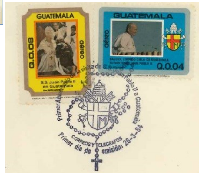
Cancellation First day of Emission REGULAR AIR POSTAL ISSUE OF 1984, I ANNIV. FIRST VISIT OF H.H. JOHN PAUL II

THIRD VISIT: July 29-30, 2002. This was his last visit to the country, at a time of greater stability after the Peace Accords.