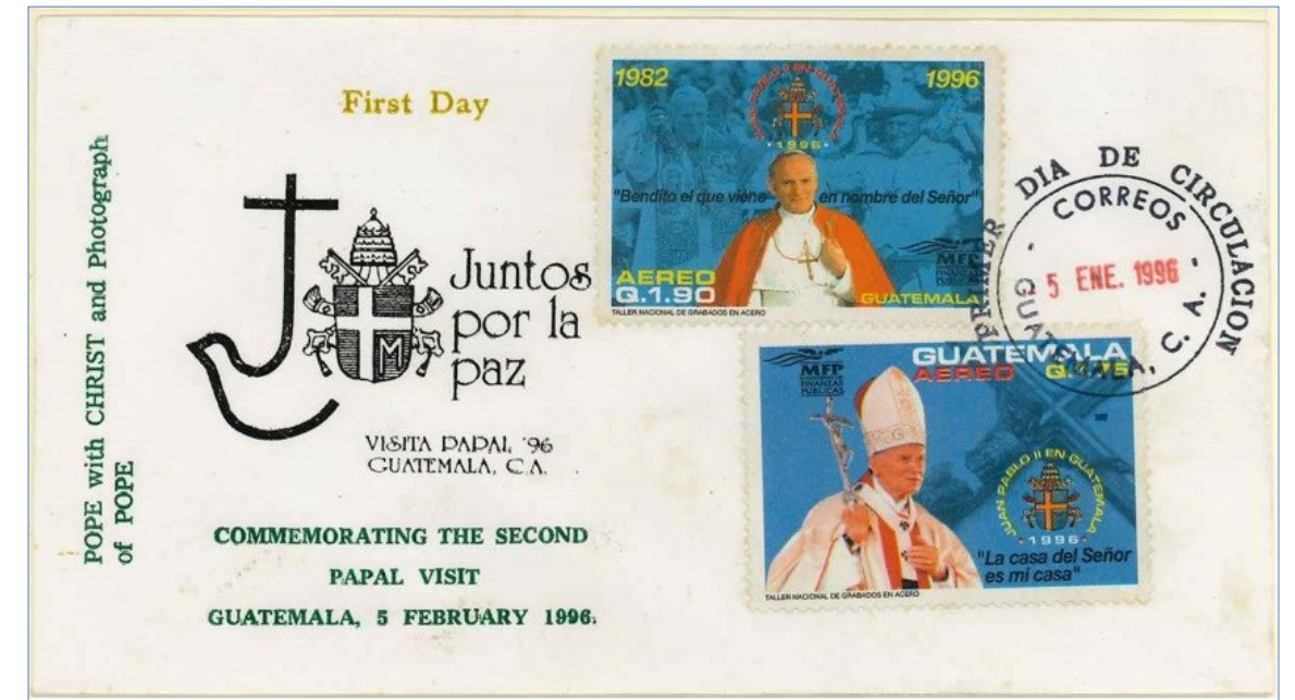
Cancellation of "Correos" of the first day, on stamps of the REGULAR AIR POSTAL ISSUE OF 1996. 2nd. Visit of His Holiness

SECOND VISIT: February 5, 1996. This visit occurred at the end of the armed conflict, when the Peace Accords were being negotiated (signed in december of that same year). Central Theme: PROMOTION OF PEACE AND FORGIVENESS. The Pope insisted on the importance of mutual forgiveness and the need to build a society based on respect and human dignity. He called for strengthening faith as a path to lasting peace.